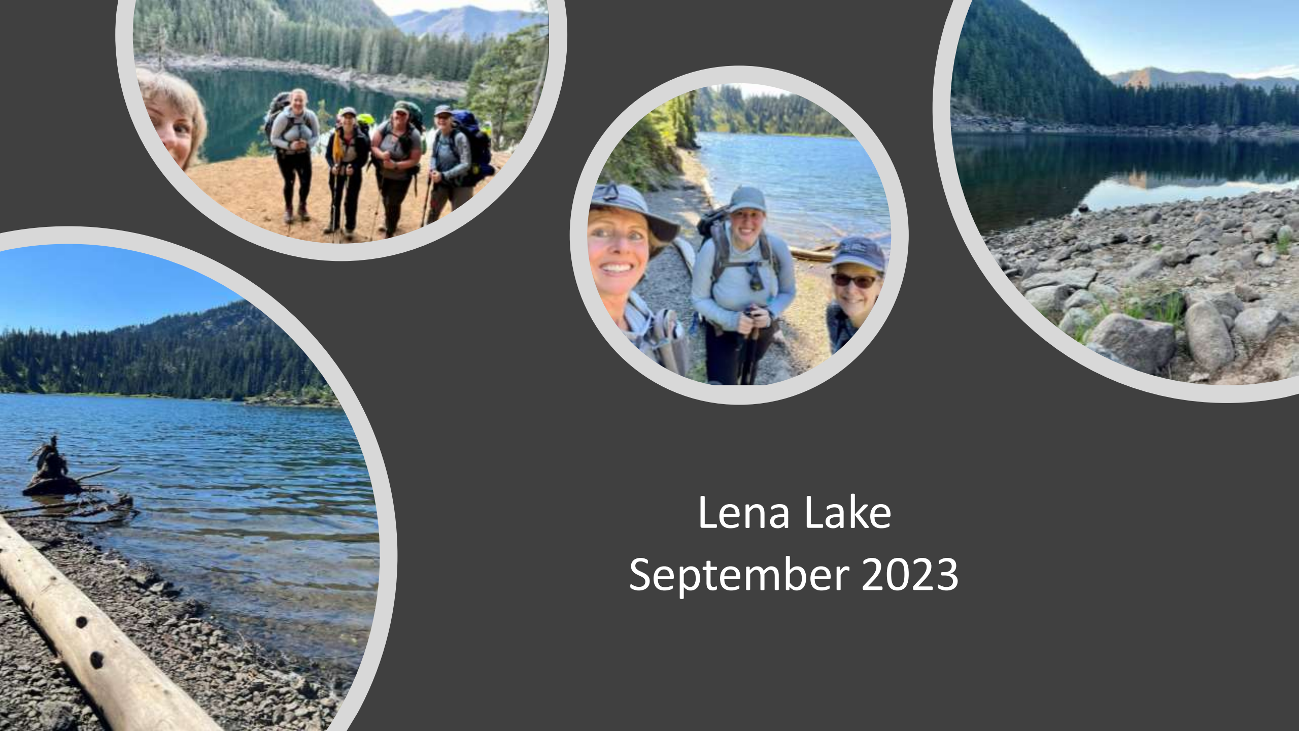
Lena Lake September 2023