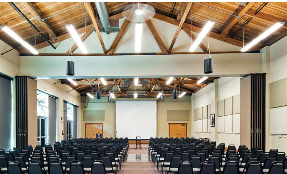
Goodman A and B, looking north

Our building has two main meeting rooms, the largest of which is our Goodman Auditorium. You can book the full auditorium for larger events, or rent smaller sections separated by air-walls. The Goodman C section contains our indoor climbing wall, which is often an inspirational curiosity for event attendees.