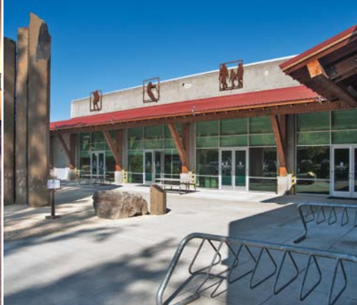
Top, left to right: Program center lobby, and program center entrance.