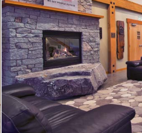
Top, left to right: Cascade room, Program center lobby