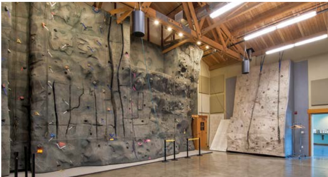
Top, left to right: Goodman A and B, looking north; Goodman C, looking south with climbing wall.