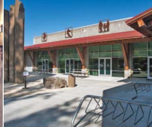
Top, left to right: Cascade room, program center lobby, and program center entrance.