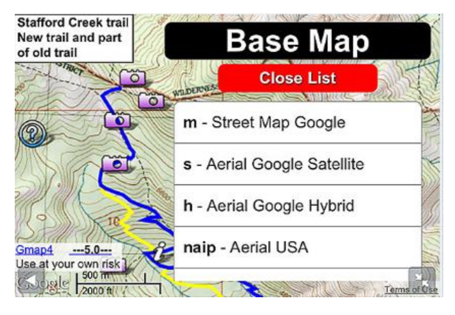
Figure 1. Gmap4 on an iPhone with 'map type' menu open

Since Gmap4 is a browser app, there is nothing to download, nothing to install. Gmap4 runs in most browsers on most devices from smartphones to desktops. Note that the browser does have to be online. When Gmap4 is running in the browser on a smartphone or other mobile device it automatically displays a touch-friendly interface.