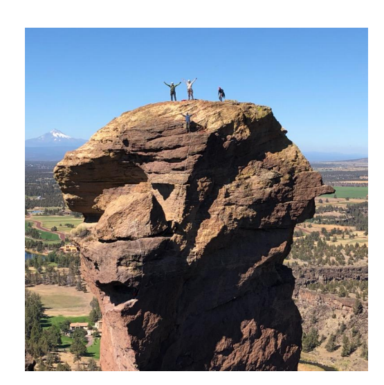
Airy start to a short and exposed bolted pitch to rappel anchors