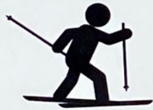
Cross Country Skiing