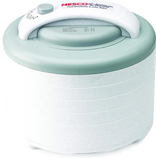
Nesco Snackmaster FD 75-A - $70-90 ONLINE