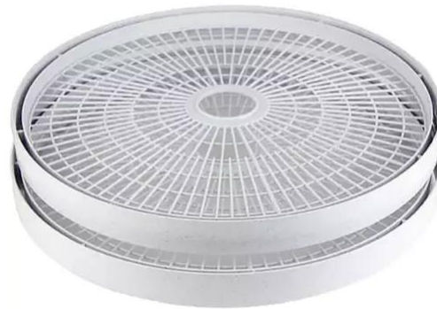
Expandable Rack set