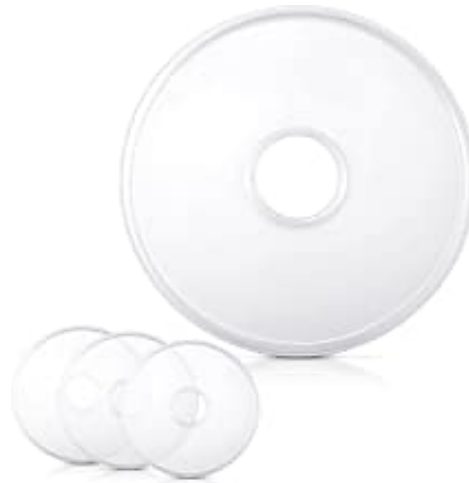
Solid Plastic Trays (for liquids)