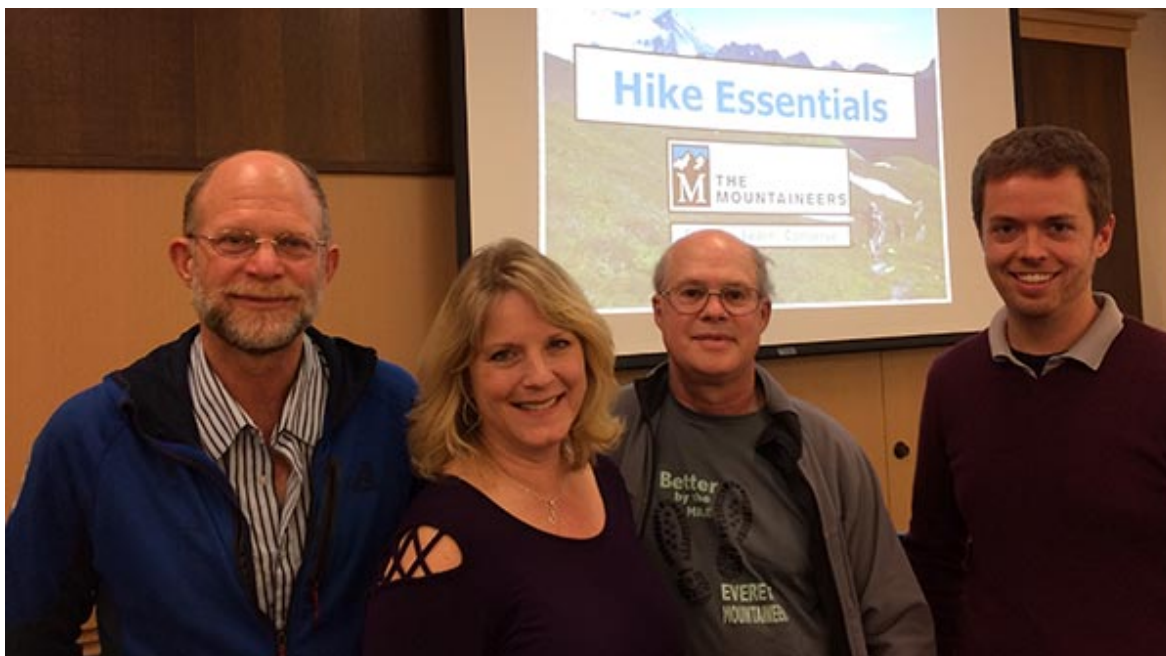
Last's years Hike Essentials speakers pose for a photo.