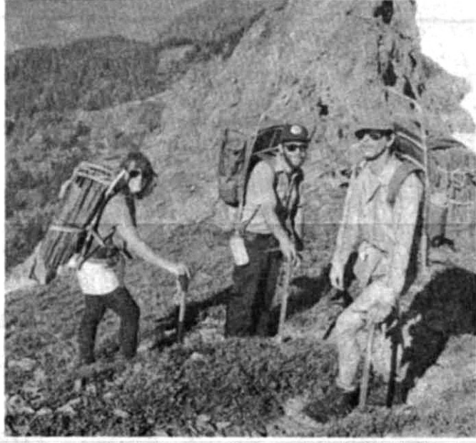
Three Fingers Lookout Project