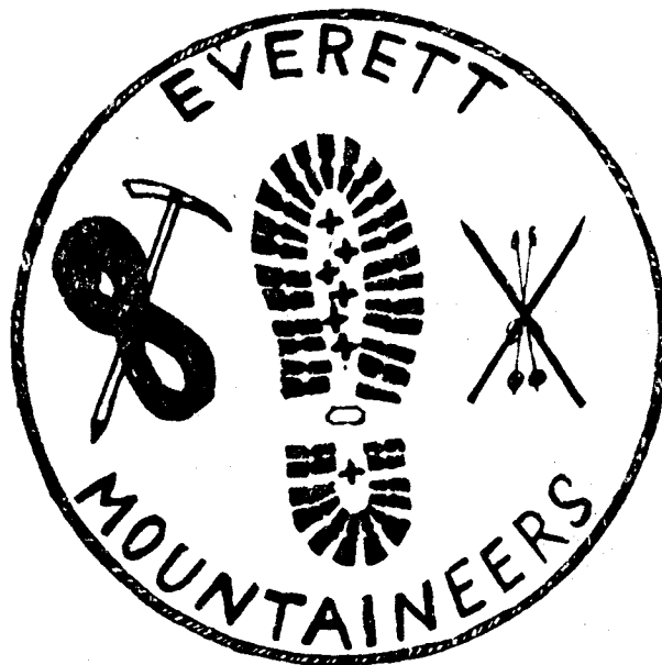
Patch designed by Larry Longley

The adoption papers of The Three Fingers Lookout are almost final. The most headway has been made with the approval of taking pack animals in on July 21-24 to move the heavy building materials to the highest point the animals can go. Then comes the "human chain" to move the supplies to the Lookout Cabin. The weekends planned for this activity are July 26-27, Aug. 2-3 and if still more work is need, Aug. 9-10. Look at your summer schedule and mark one of these weekends to help, or more if you can. These weekends are for work on the Lookout but the trail will also need some work after the pack animals have gone over it so Gordon Rogers is organizing a trail maintance crew to make repairs and would also like to have food provided for the work crews. All of this is going to require a lot of volunteers. More information and details can be obtained from Jerry Thompson, Carol Pinneo 488-4125 or Jim Eychaner 723-0237.