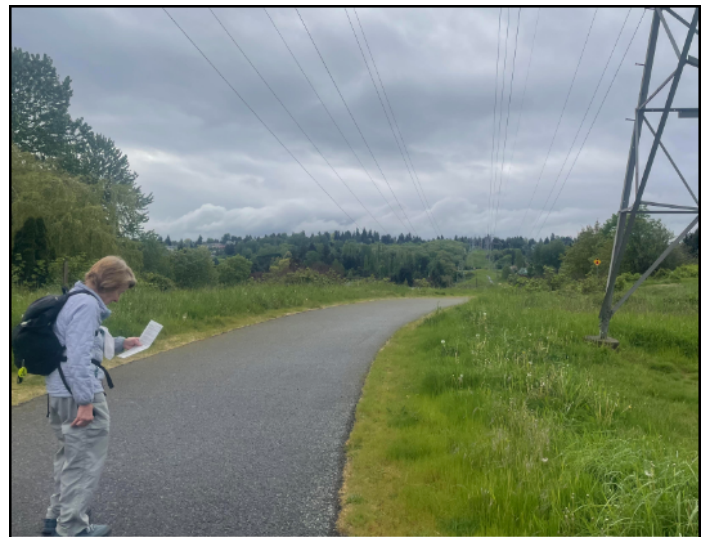
Chief Sealth Trail, Mt Rainier?

Boeing's imprint on this section is profound. Boeing Field was Seattle's primary airport from 1928 to the late 1940s. During WW2, a 26-acre, fake neighborhood (burlap, canvas and chicken wire) camouflaged the field. A fine way to end Section 6 East would be to visit the Museum of Flight in the SW corner of the field -- 9404 E. Marginal Way South