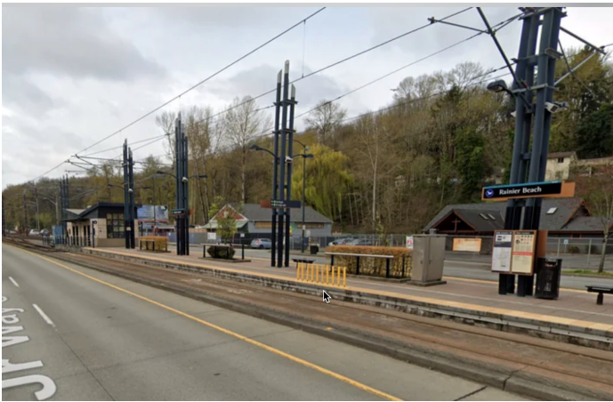
Rainier Beach 1 Line Station