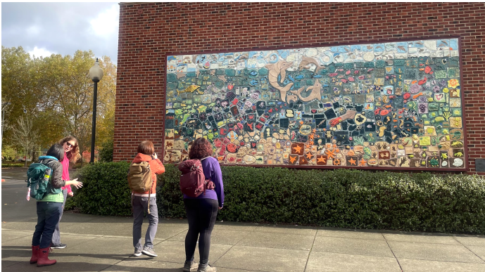
Dunlap Elementary Mural #2