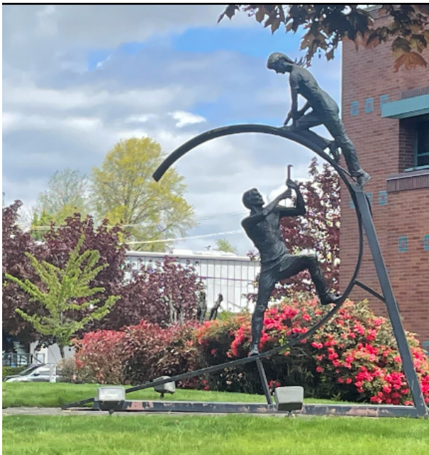
IAM Union Hall sculpture (Ken Lonon)