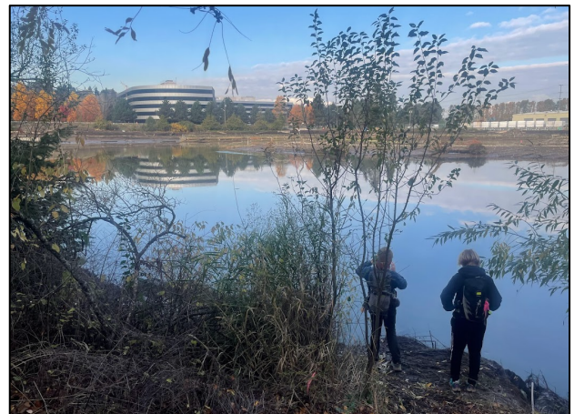
Duwamish Turning Basin#3