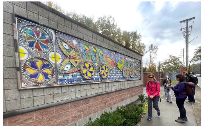
Seattle PUD site mural