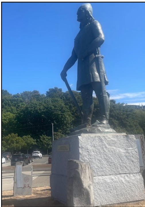
Leif Erickson