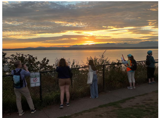
Sunset Hill Park October 2024