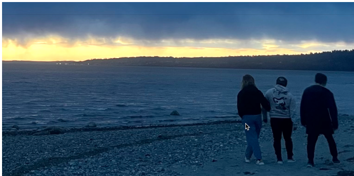
Classic Seattle beach sunset.