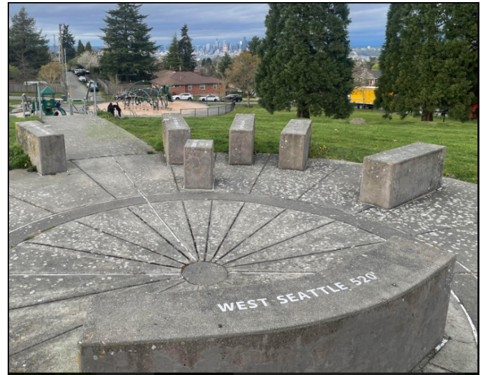
Myrtle Reservoir Lookout

Congratulations, you just completed Section 7 of the Seattle Olmsted 70!