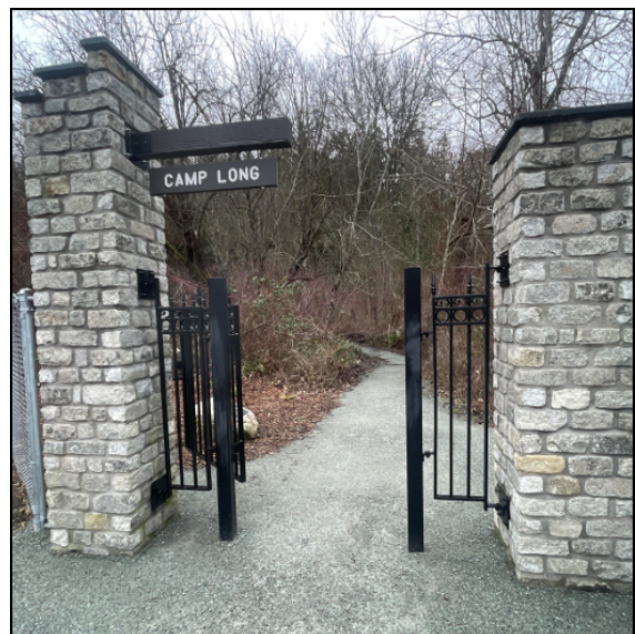
South gate Camp Long – Photo P Hendrickson