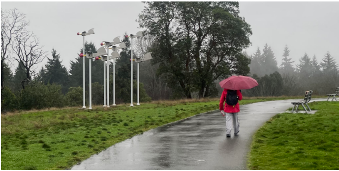
Wind vane sculptures signal closeness to SeaTac International and Boeing Field.