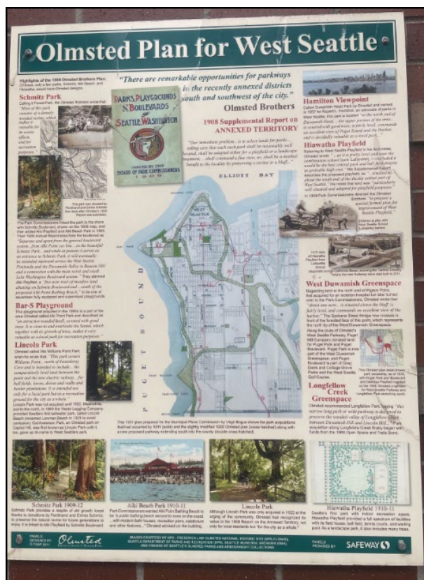
Olmsted Plan-South Wall Safeway