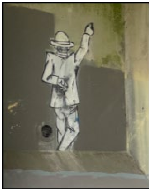
Schmitz Park Bridge guy