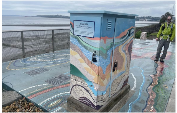
Tracing Alki, Pump Station 38