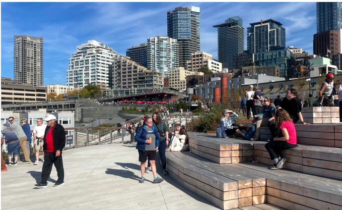
Overlook Walk looking NE