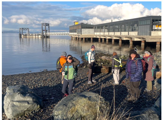
Pioneer Square Habitat Beach – Photo P Hendrickson

Heading back to Downtown or Colman Docks? One block west on West McGraw Street go right (north) onto 34 th Avenue W for Bus #24/124.