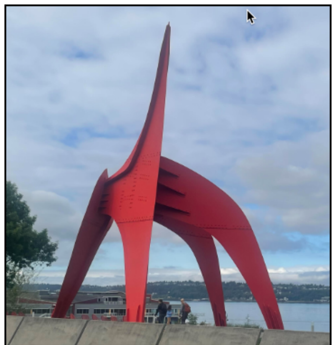
The Calder Eagle