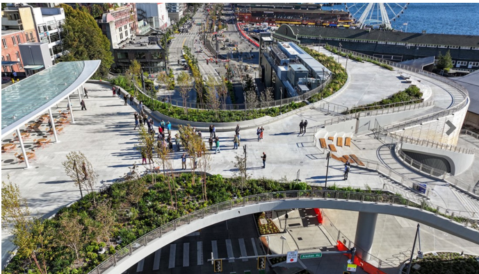
Overlook Walk to SW