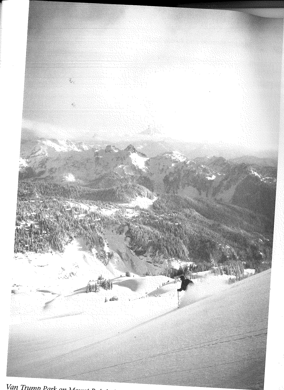
Van Trump Park on Mount Rainier's west side

Good skiing is possible all the way to 10,000 feet. This side of the mountain is generally more sheltered from the wind than the Muir snowfield. Consequently, the snow tends to be less wind damaged.